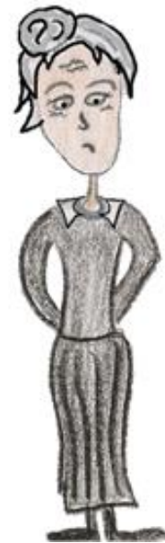
Berthe Erica Crow